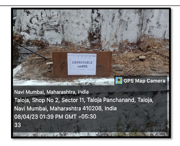
Degradable Waste in our college campus