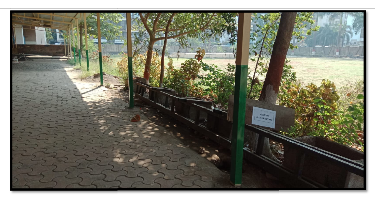
Green and Clean Campus Camps