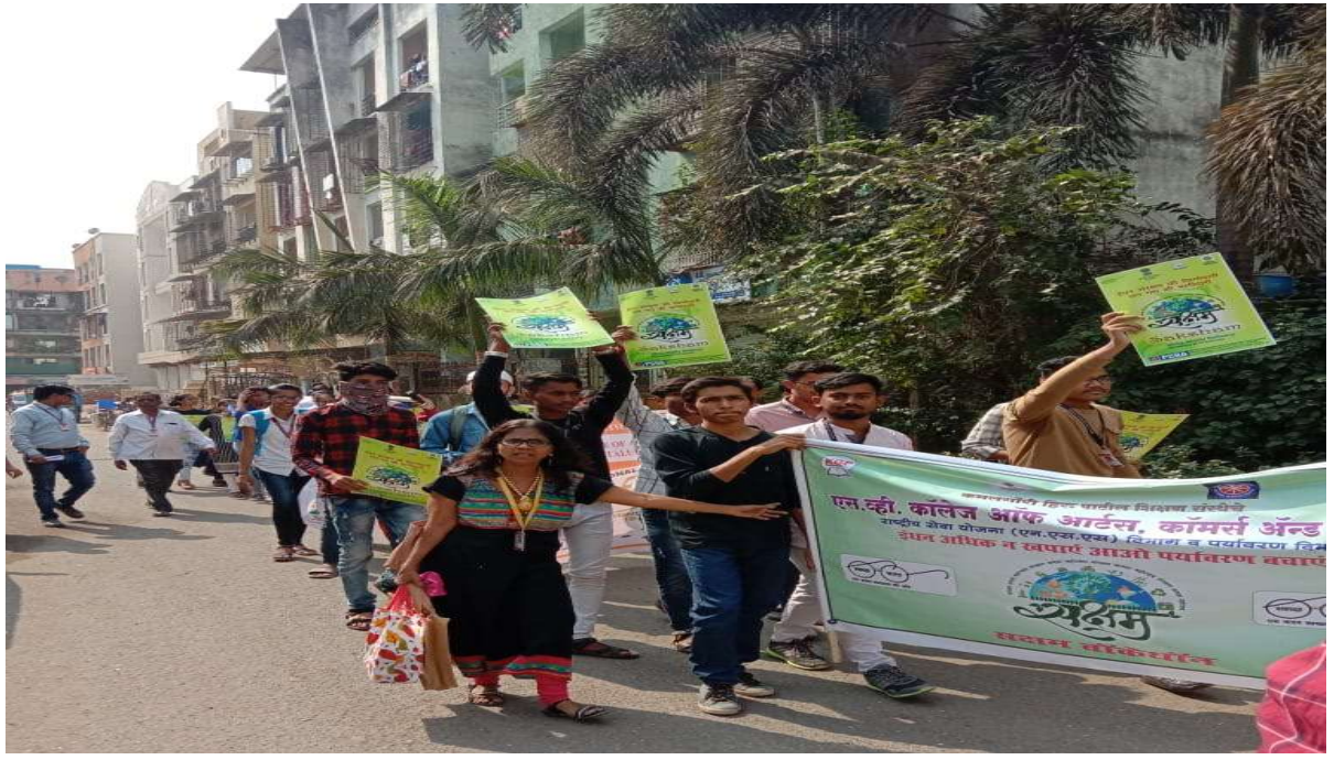
Swacha Bharat Abhiyan Organize of Saksham Rally 14 Feb 2020