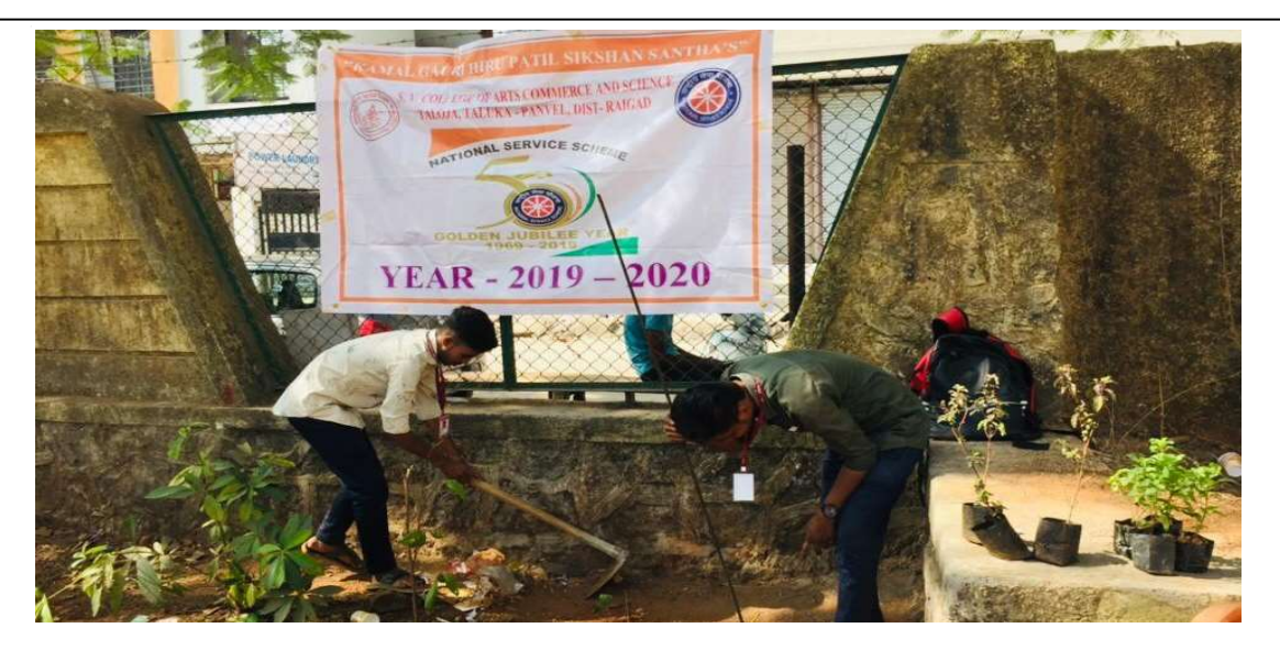
NSS students during Tree Plantation 28 Nov 2019