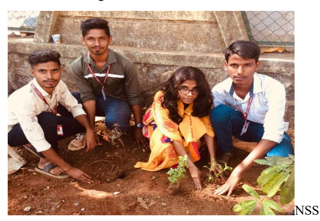
students during Tree Plantation 28 Nov 2019