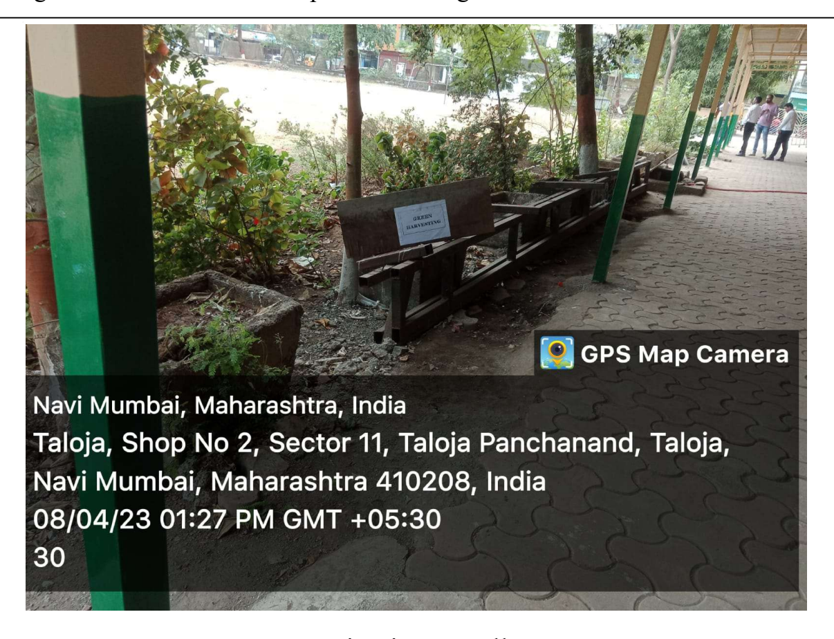
Green Conservation in our college campus