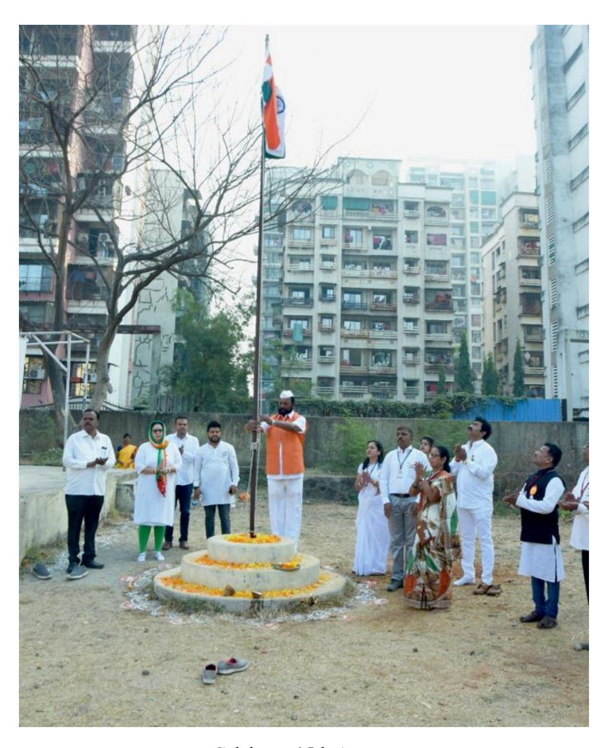
Celebrate 15th August