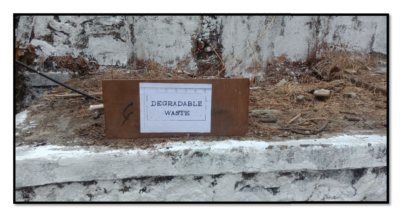
We have done the activity of Management of Degradable west in our College Campus

College Code: 922 / Website: https://svacscollege.co.in / Contact: 8976770100 / 9594535370