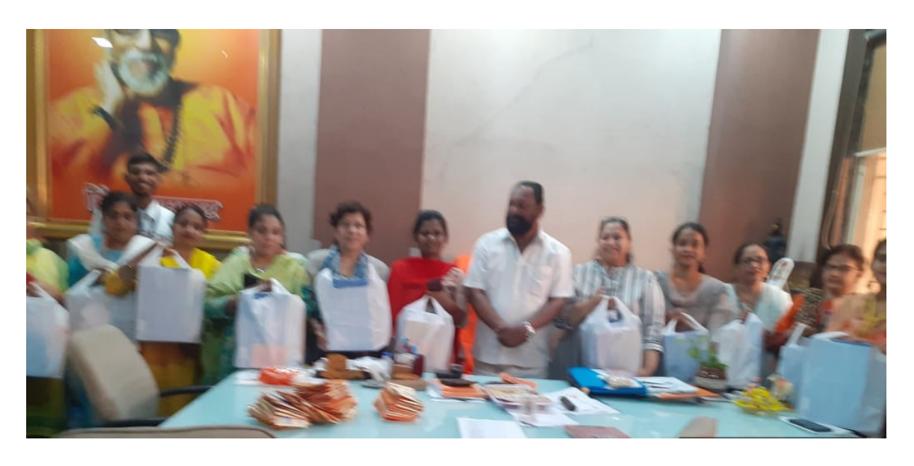
KAMAL GAURY HIRUPATIL SHIKSHAN SANSTHA was help on the occasion of Diwali