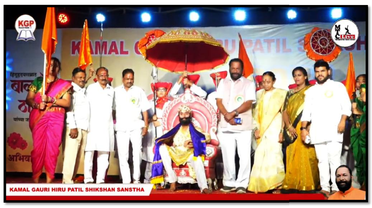
Celebrate the Shiv jayanti and also orgnise the rally