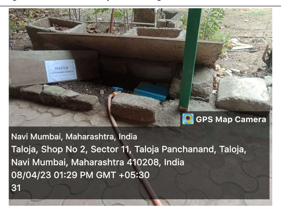
Water Conservation in our college campus