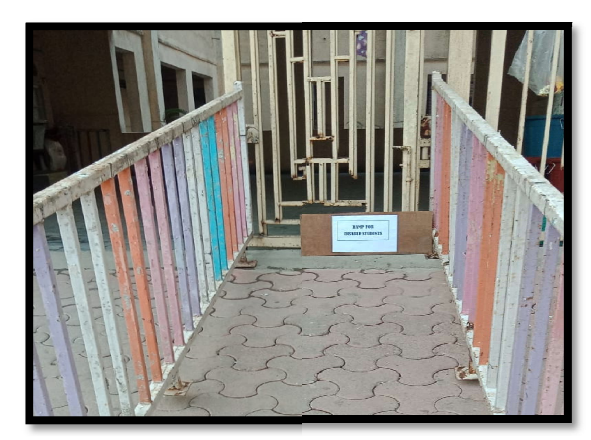
Disabled friendly barrier free Environment