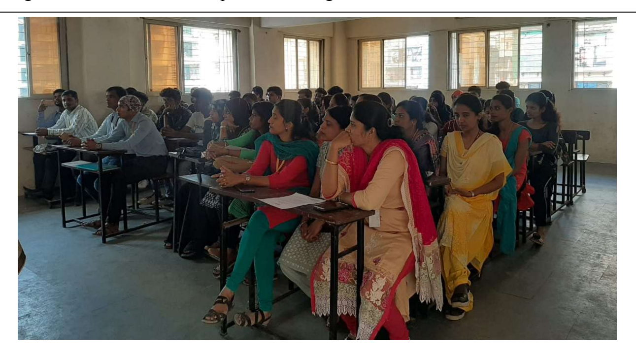
of lecture & students and staff about Sardar Vallabhai 31 Oct 2019