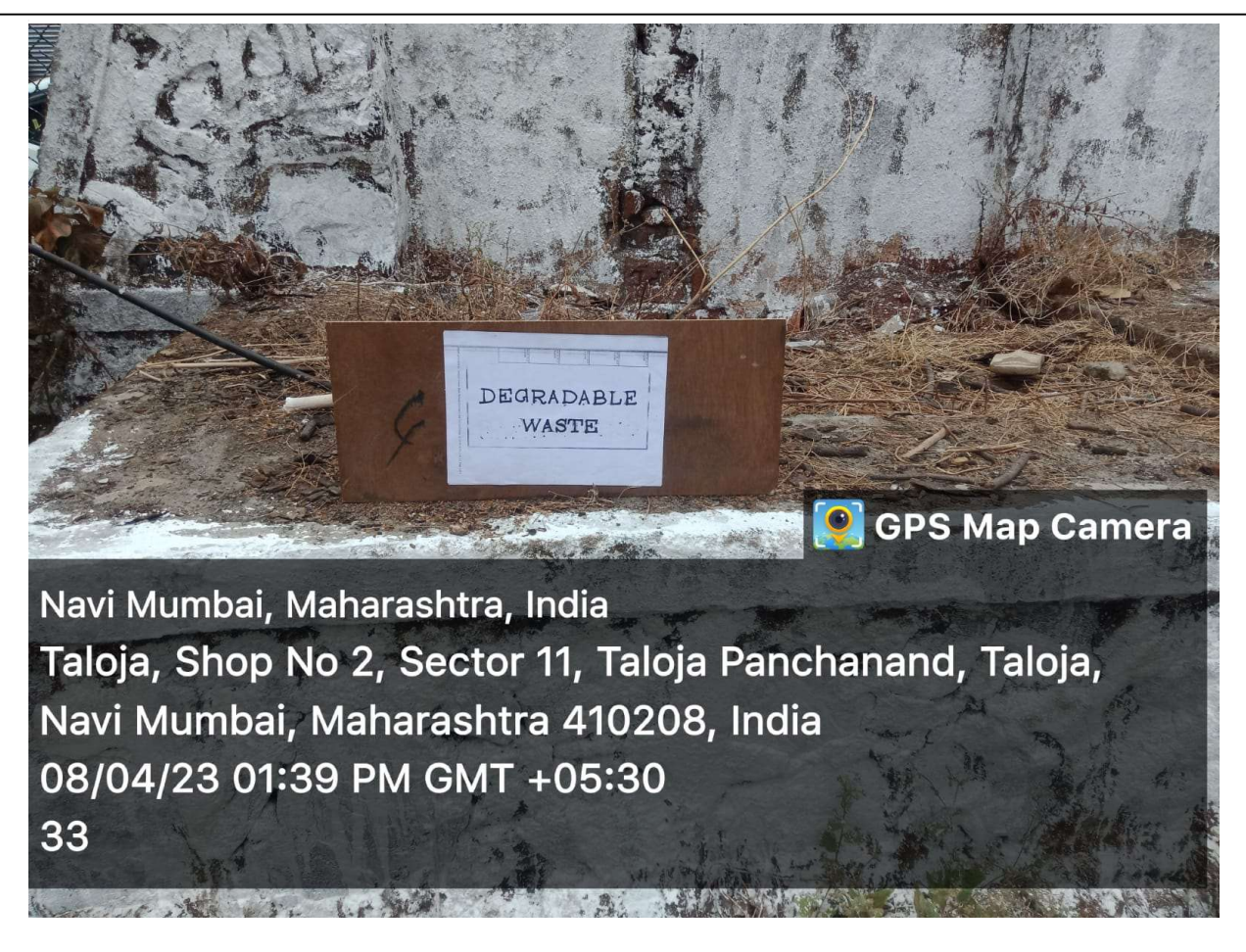
Degradable Waste in our college campus