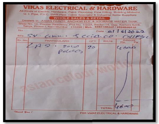
Our college camps use of LED Tubes for Save the Energy