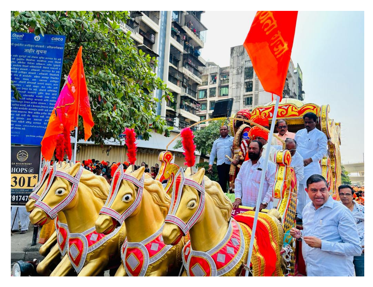
Celebrate the Shiv jayanti and also orgnise the rally