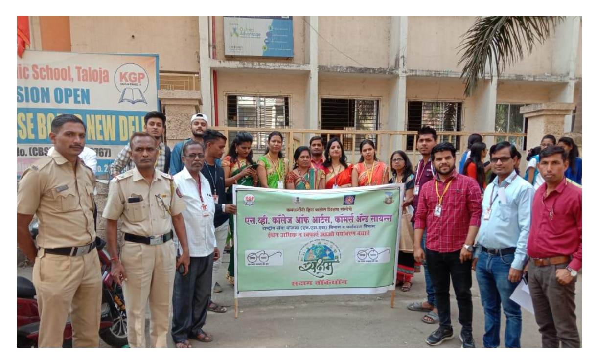
Paryavaran Bachav Shaksham Rally