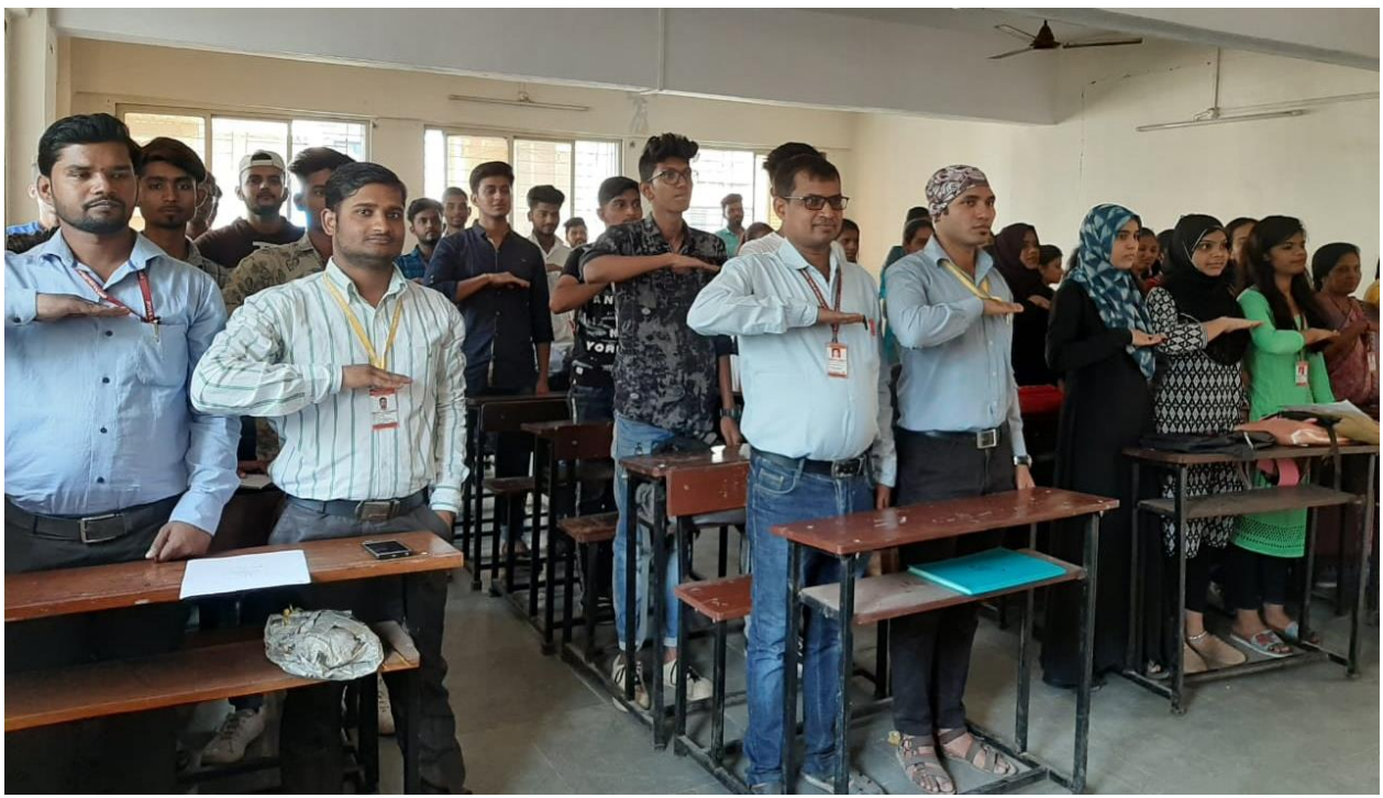
Matru Vandana Sapath Rally