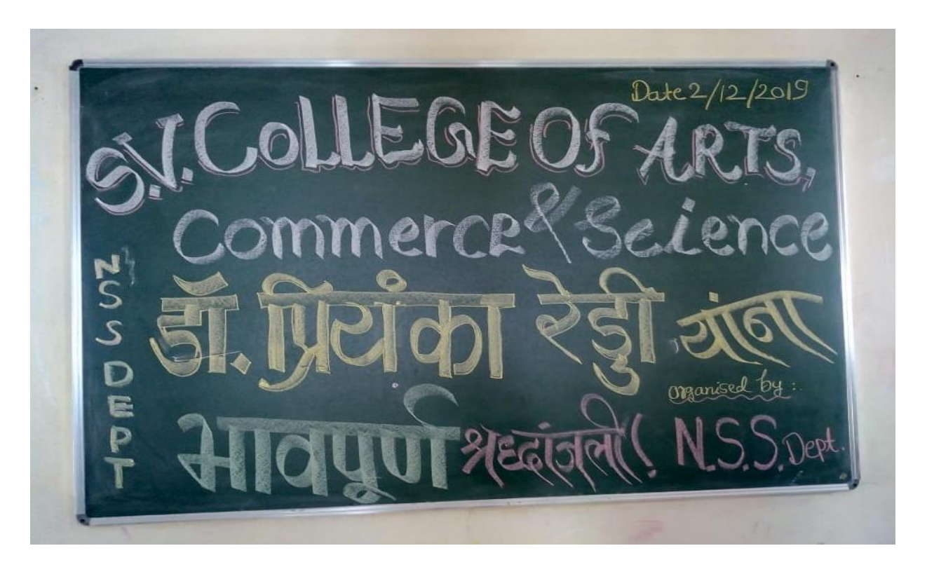
Organize to Rally justice to Dr. Priyanka Reddy

Plot no. 29,Sector 11, Taloja,Phase-1 Navi Mumbai-410208 College Code: 922 / Web: svacscollege.co.in / Ph.02265281100/8976770100