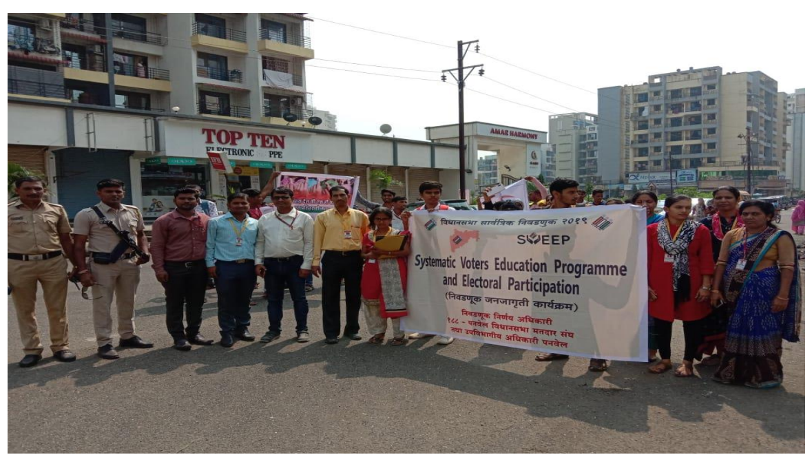
Rally for voter awareness