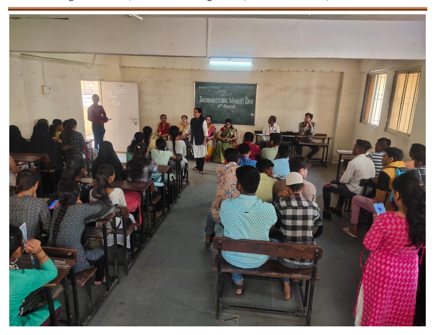
Awareness on Women Empowerment