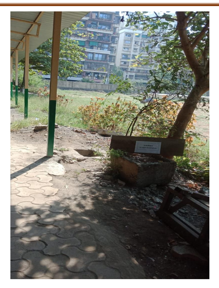
Water Harvesting in our college campus

Plot no. 29,Sector 11, Taloja,Phase-1 Navi Mumbai-410208 College Code: 922 / Web: svacscollege.co.in / Ph.02265281100/8976770100